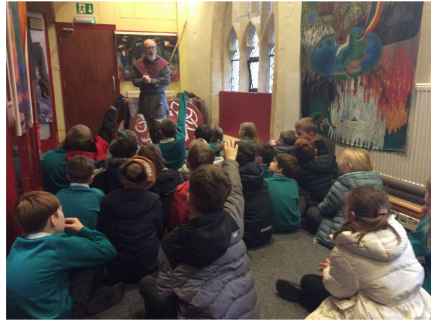
Y4 - The trip to Jorvik led to Viking battles and a wealth of mythical stories