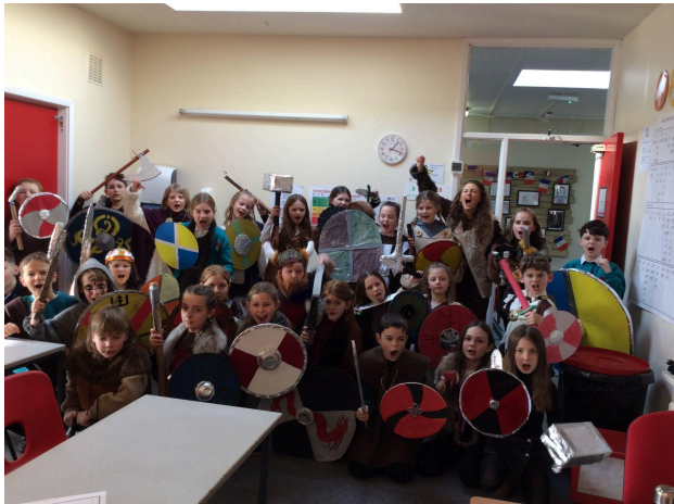
Y5 - A real life Battle of Hastings took place