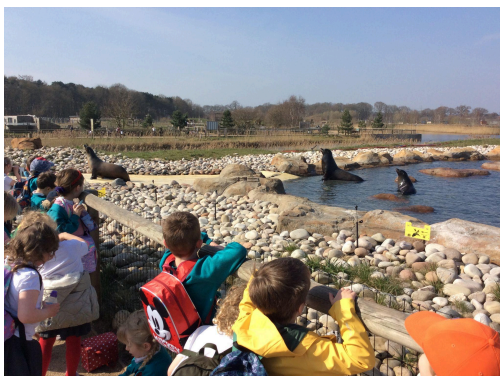
Y1 - The children had a great time at The Yorkshire Wildlife Park