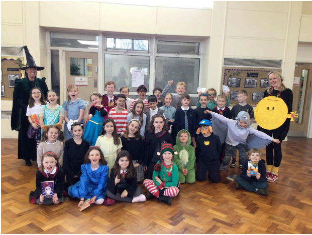
Y3 - A fabulous effort was made for World Book Day