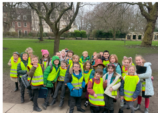
Y2 - A fabulous day out was had at York Art Gallery for the William Morris exhibition