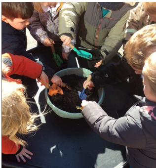
N - The children in Nursery have been busy planting beans and sunflowers.