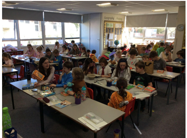
Y6 - One of their highlights was reading with the younger children on World Book day.